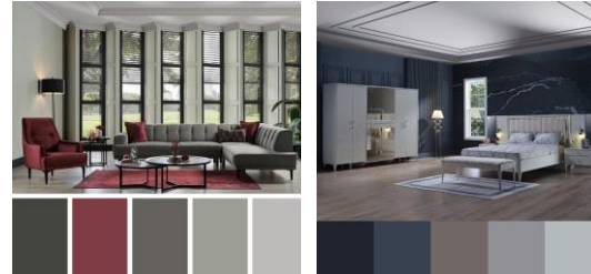
Fig 4. The most considered colour themes by the users in Mosul city according to the record of Istikbal Furniture Company Branch) 2019-2022.

interested the users for living room, guest room, and kitchen in sequence, which matched with the interview and survey results. Figure (4) shows the most considered colour themes in one of the well-known furniture companies in Mosul.